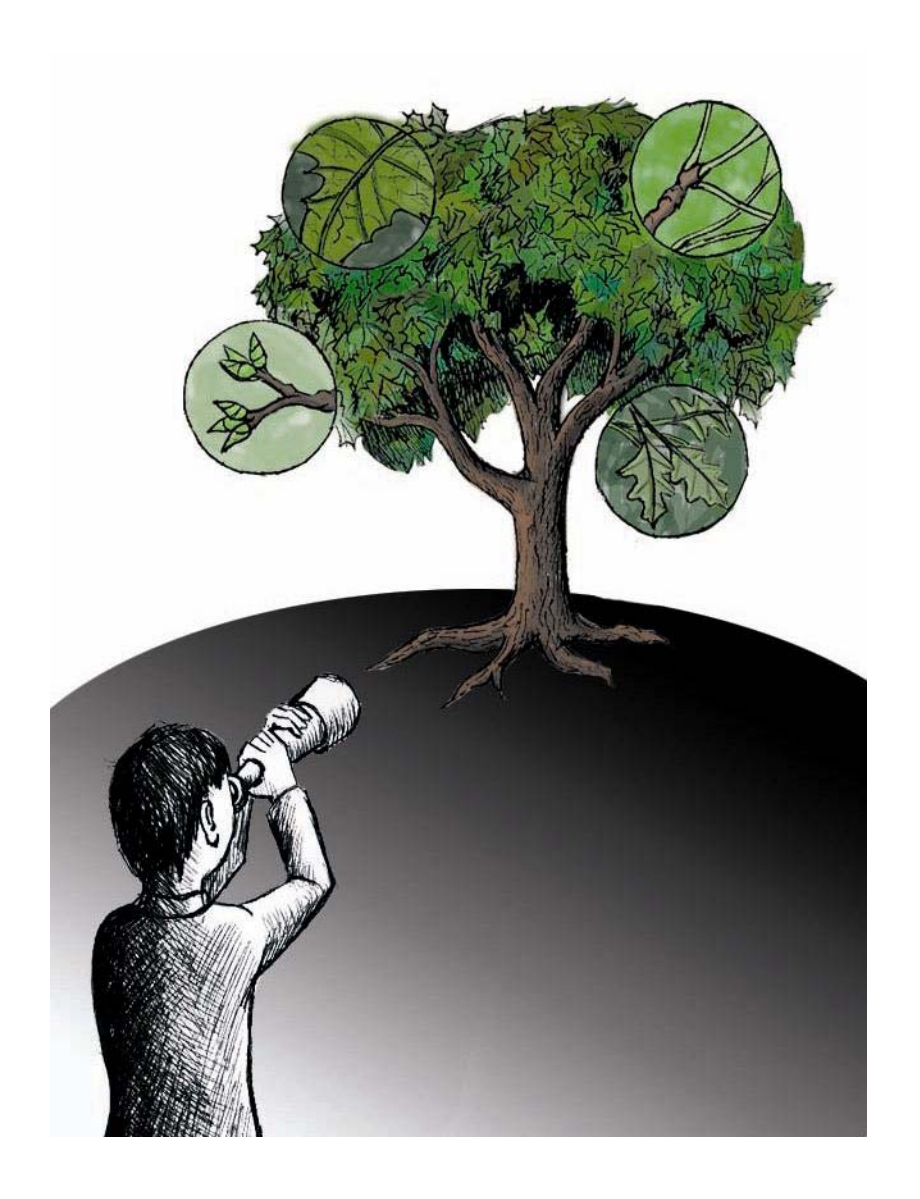
Proof of Principle 2: Our knowledge is proportional to the number and kind of points of view we have.

There are two kinds of knowledge: perceptual and conceptual. The following is a proof of Principle 2 for perceptual knowledge .