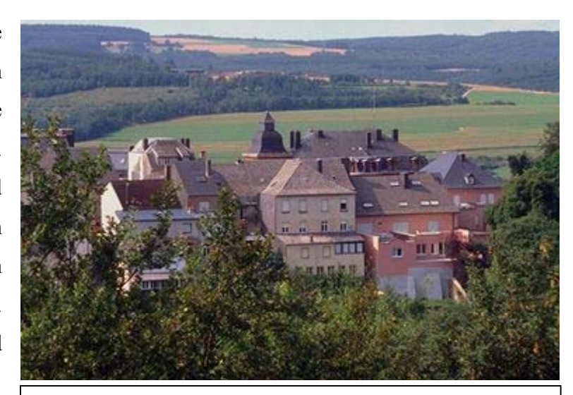
Points of view: 1 A view of houses from the top

Generally speaking, the more senses we perceive an object through, the more knowledge we have of it. Anyone who has tried watching television with the sound turned down can appreciate this statement. Food is another good example of this principle. Our appreciation of food is